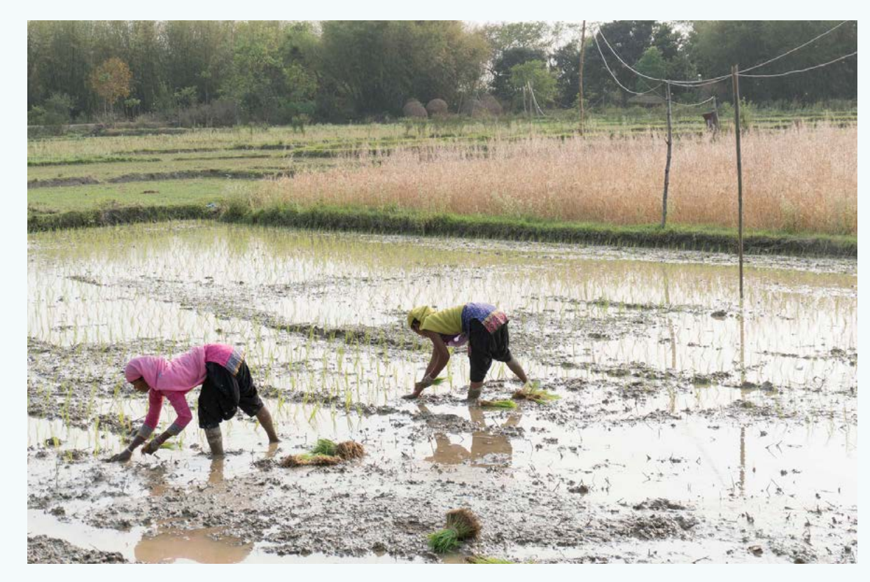
Two women in a field after a solar water pump was installed on their farm in Saptari, Nepal.

Some farmers were astonished when the system first pumped water to their tank. In most rural areas, people are mostly familiar with solar home lighting systems only, but, to see its other beneficial applications, especially in irritation, has expanded their knowledge and confidence in the technology.