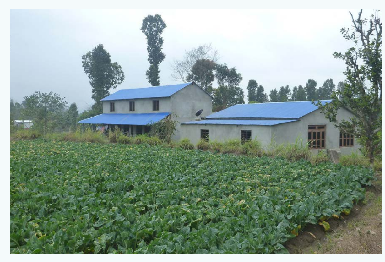
A Nepali farmer's house and crops. Taken during a site visit to Makwanpur in 2016.