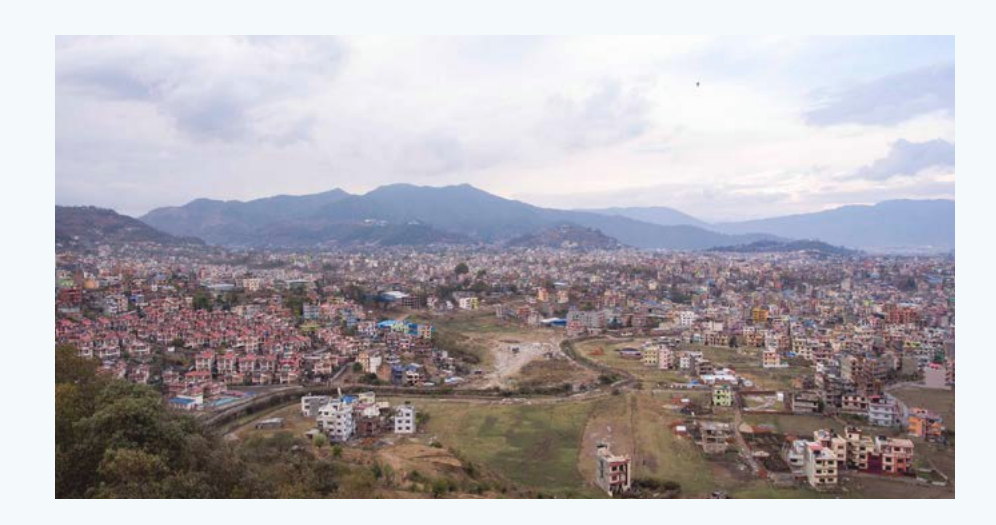
A view of Kathmandu, Nepal. For more info on this project, watch our video.

We are currently expanding the solar installation to a total of 67 kWp which covers 35% of the hospital's total energy needs. With the help of solar, Kirtipur Hospital has significantly reduced their operating expenses, enabling them to treat more patients and upgrade their services. The hospital is currently planning to expand from 100 to 300 beds.