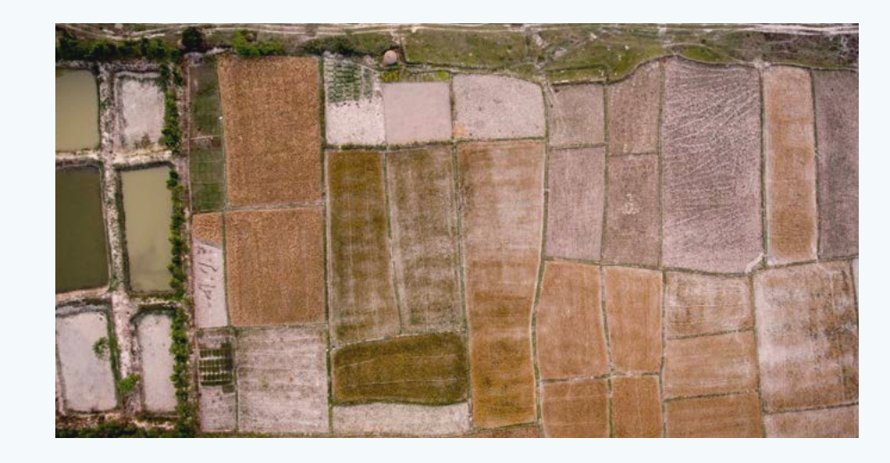
Aerial drone shot of farm land in Saptari. You can read more about the project <u>here</u>.

Farmers no longer have to depend on diesel fuel or suffer from poor grid connection that hampers their timely crop production.