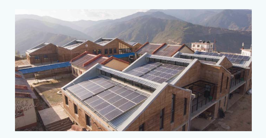
An aerial view of solar panels installed by <u>SunFarmer Nepal at Bayalpata</u>

This project is in collaboration with the US nonprofit <u>Possible</u> Health.